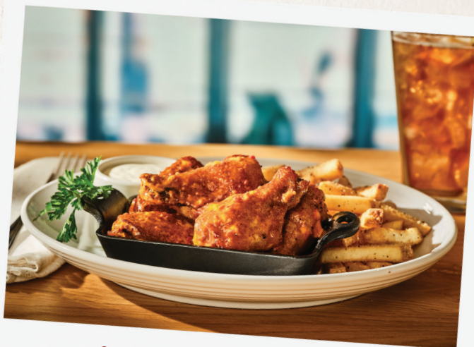
Calabrian Wings Combo

Lunch portion coated with Mama Mandola's breadcrumbs, sautéed and topped with our pomodoro sauce, parmesan, romano and mozzarella cheese (640 calories) | 14.99