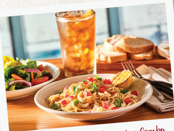
Garlic Lemon Herb Linguine Combo

Linguine tossed in our house-made "Liquid Gold" sauce of garlic, lemon butter, Italian herbs, white wine, diced tomatoes and basil (620 calories) | 12.99