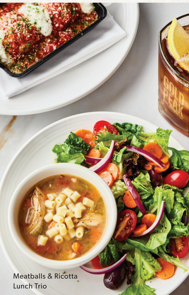
Meatballs & Ricotta Lunch Trio