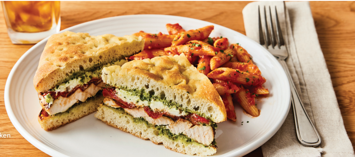
Bruschette Chicken Bistro Sandwich

Italian favorites prepared with your time in mind