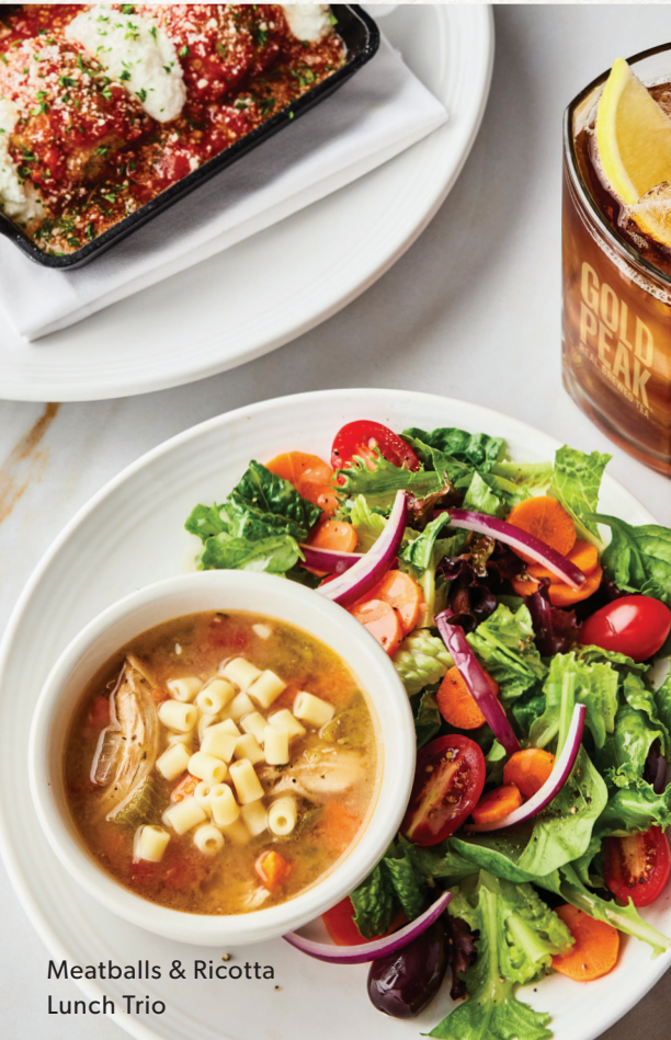
Meatballs & Ricotta Lunch Trio