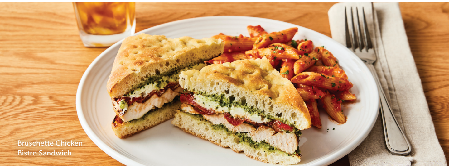
Bruschette Chicken Bistro Sandwich

Italian favorites prepared with your time in mind