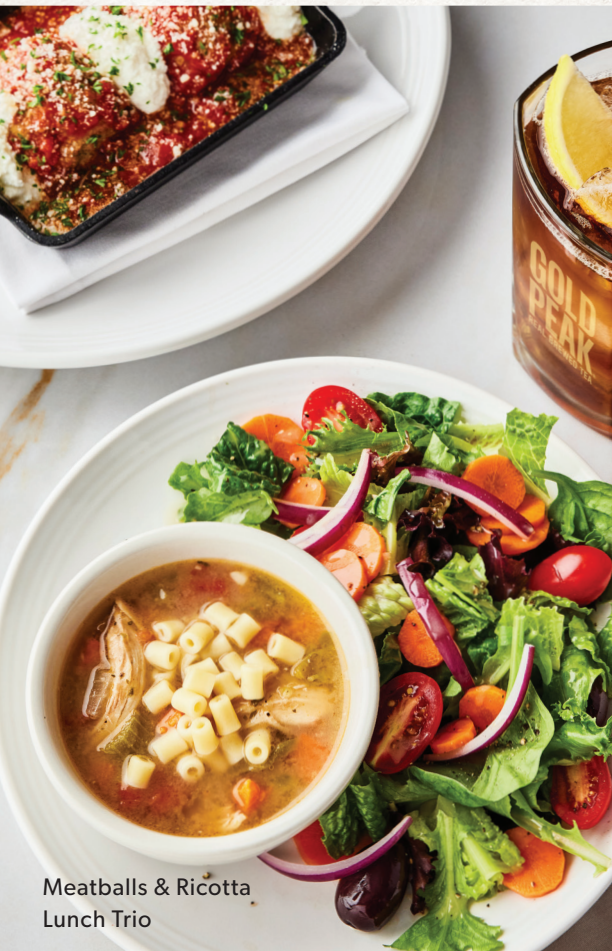
Meatballs & Ricotta Lunch Trio