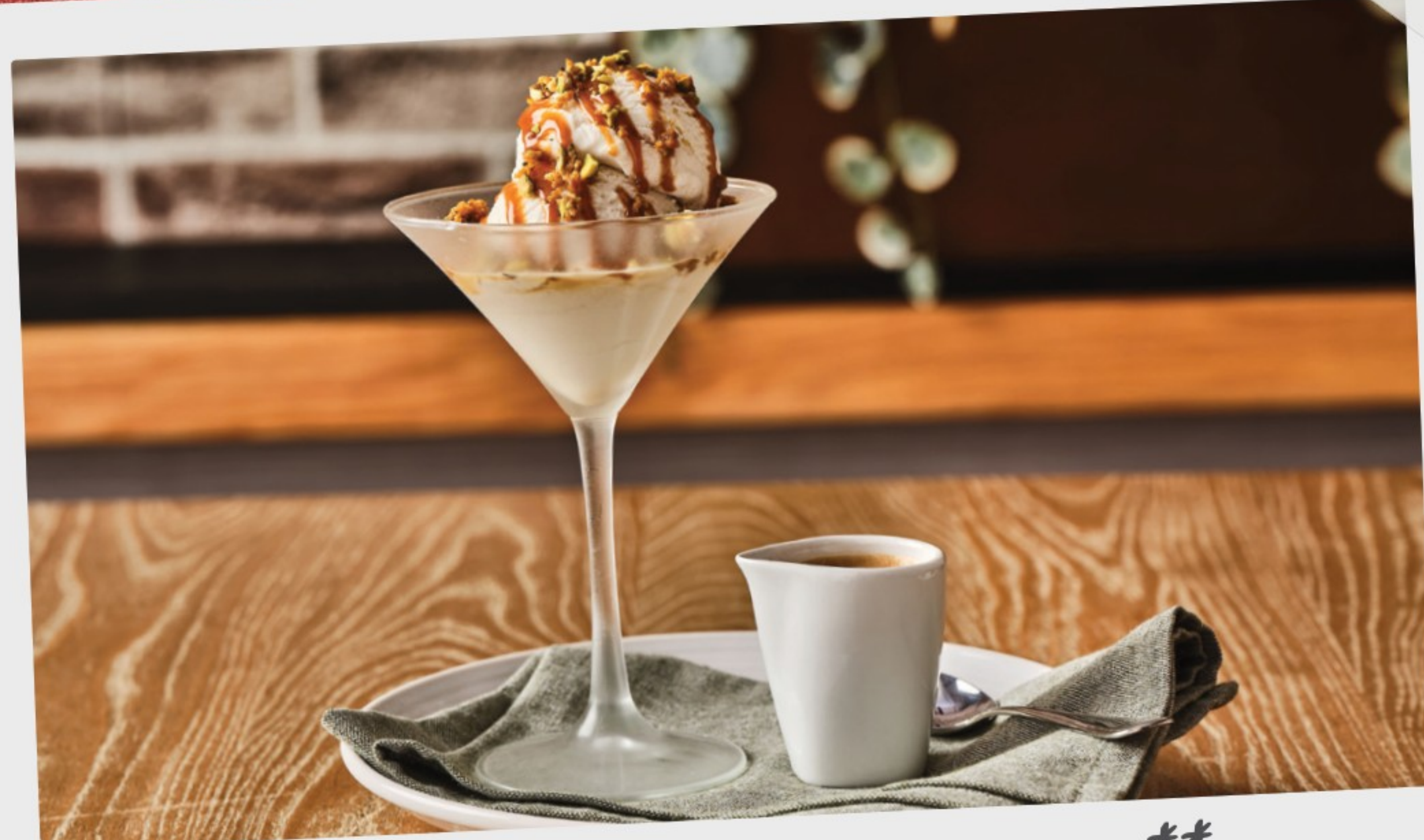
Pistachio Caramel Affogato **