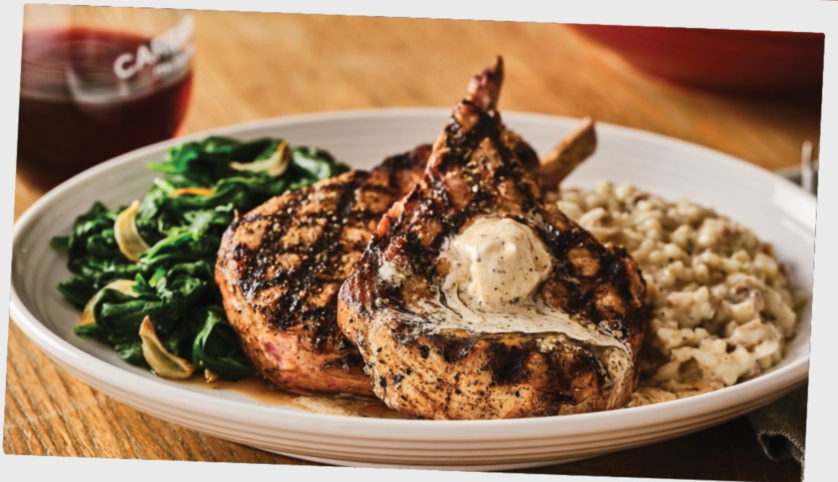
Bone-In Pork Chops *