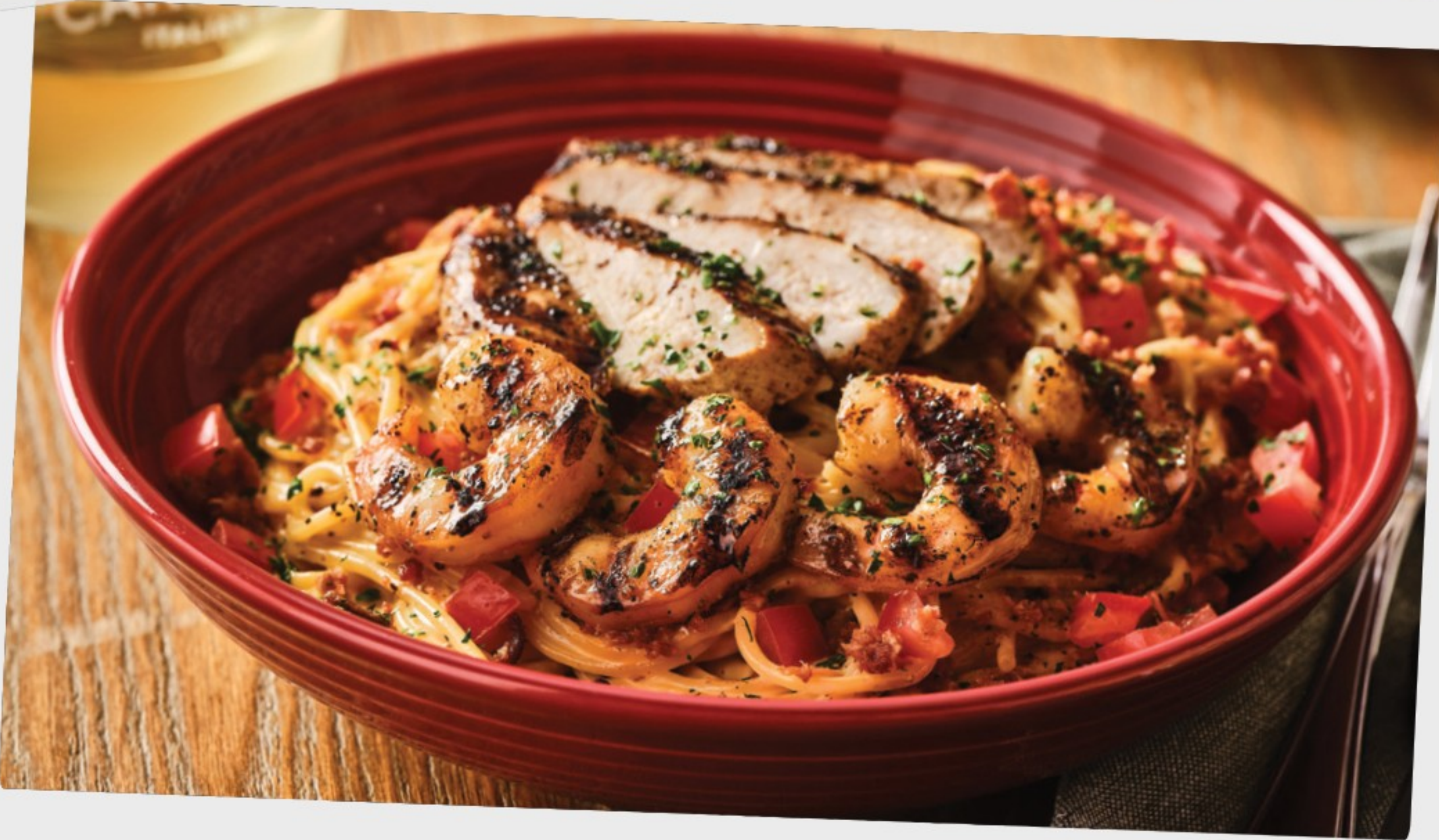
Chicken & Shrimp Carbonara

Spaghetti tossed in a rich bacon cream sauce with eggs, parmesan, romano cheese, and diced tomatoes, topped with bacon, wood-grilled chicken and shrimp (2050 calories) | 23.49