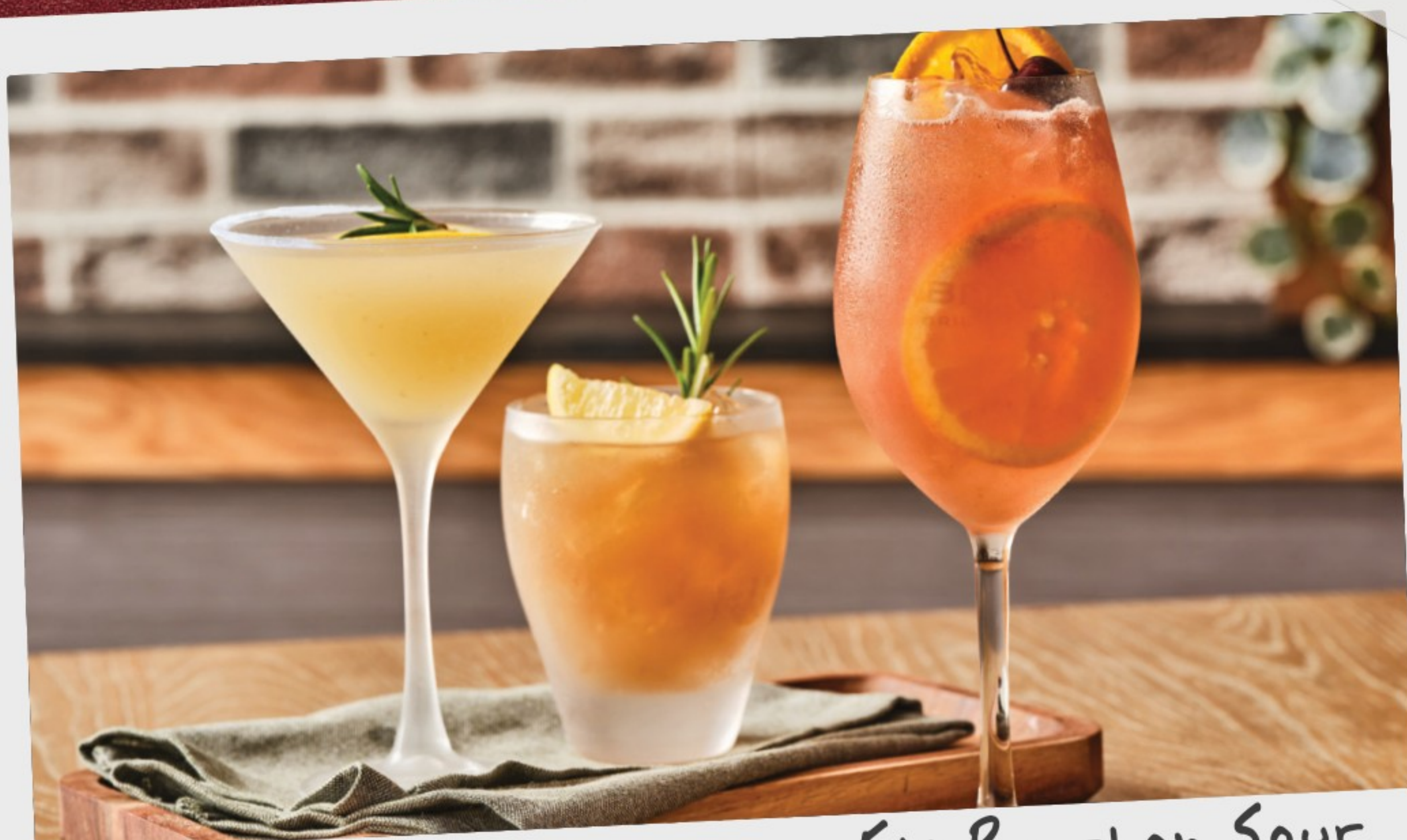
Rosemary Lemon Drop, Fig Bourbon Sour & Orchard Sangria