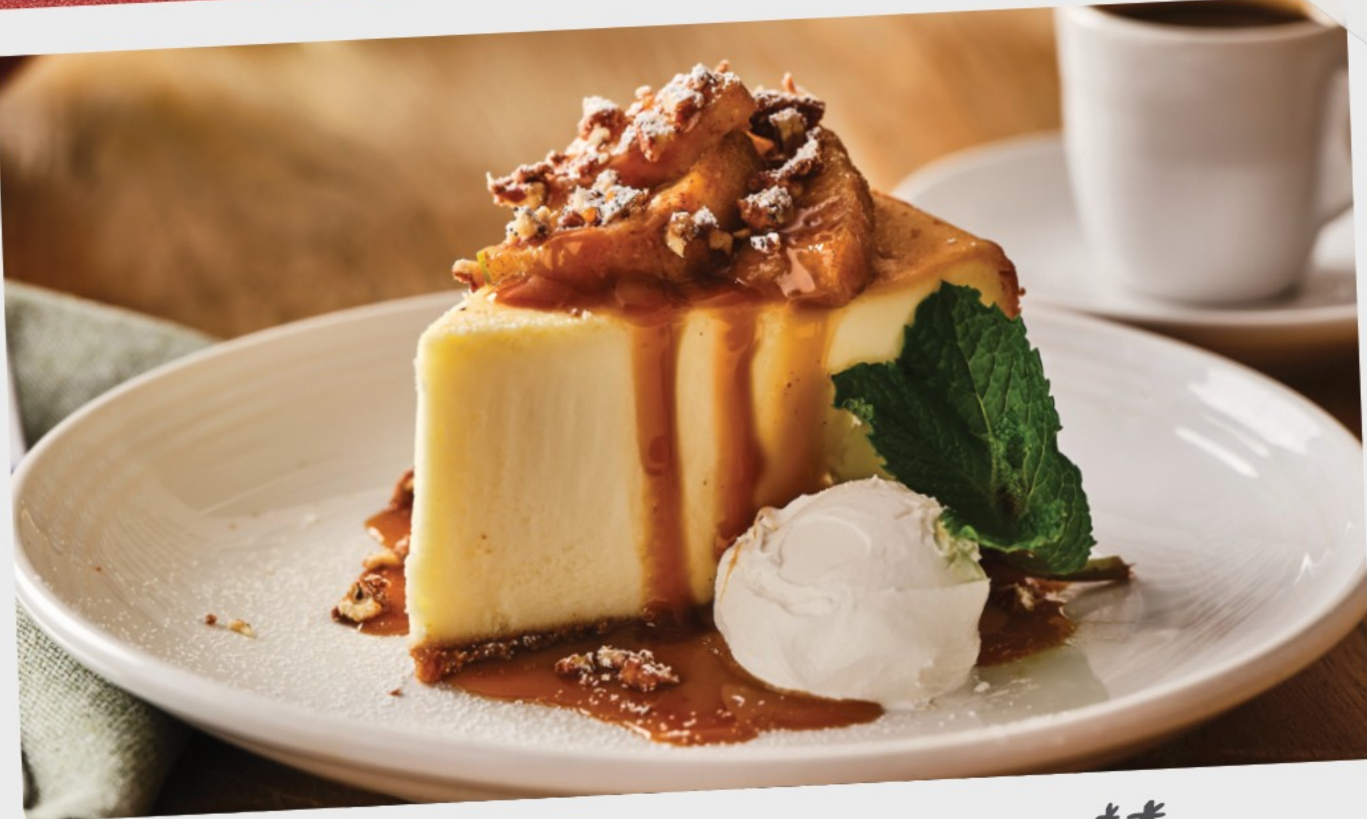
Caramel Apple Cheesecake **

New York-style cheesecake topped with caramel apples and toasted cinnamon pecans. Served with whipped cream and mint (1230 calories) | 11.49