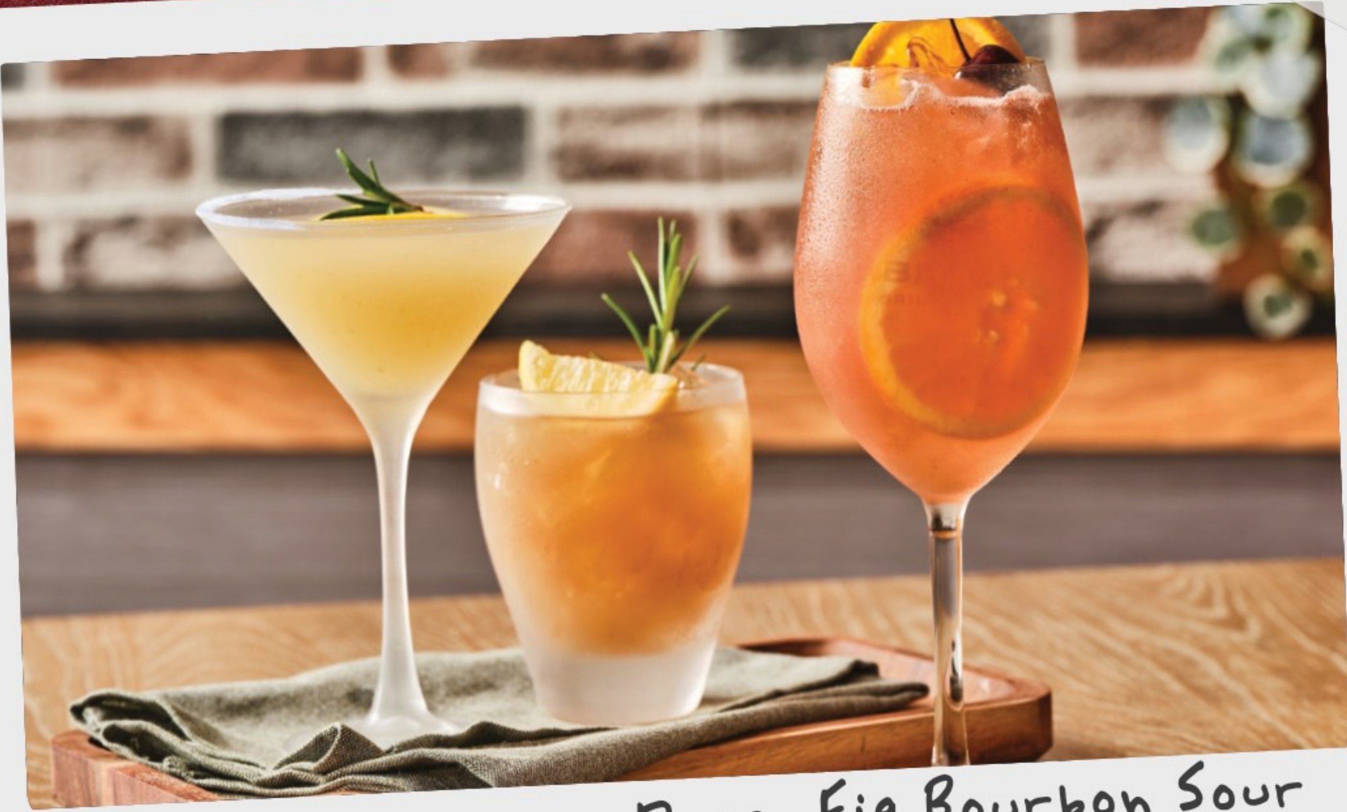
Rosemary Lemon Drop, Fig Bourbon Sour & Orchard Sangria