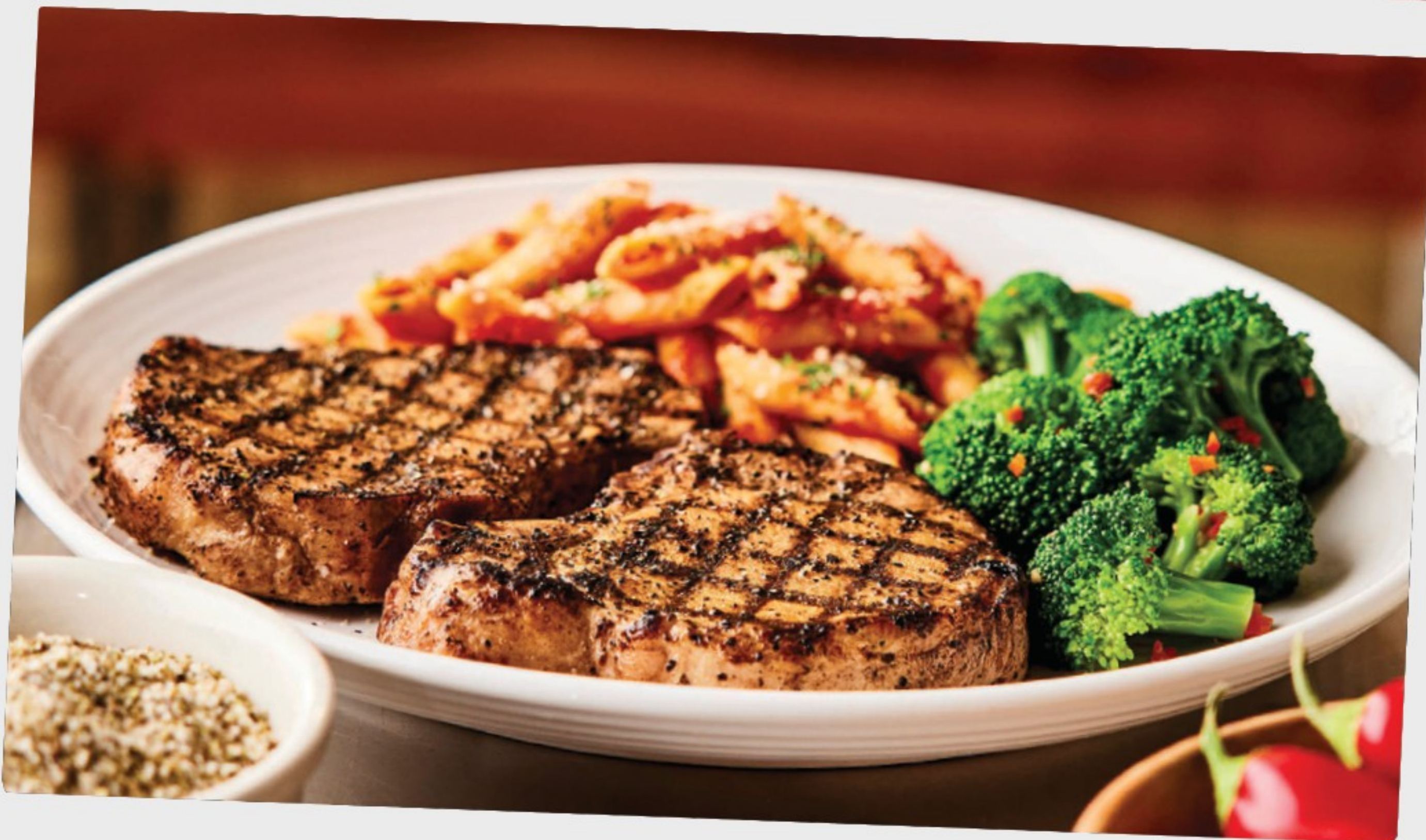
Tuscan-Grilled Pork Chops *

JOSH CELLARS BOURBON BARREL RESERVE, CABERNET SAUVIGNON